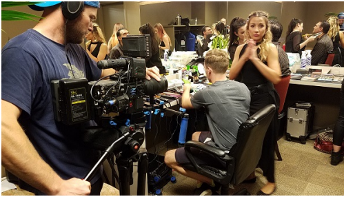
NCIS Los Angeles actor Barrett Foa is used to being in the make-up chair...