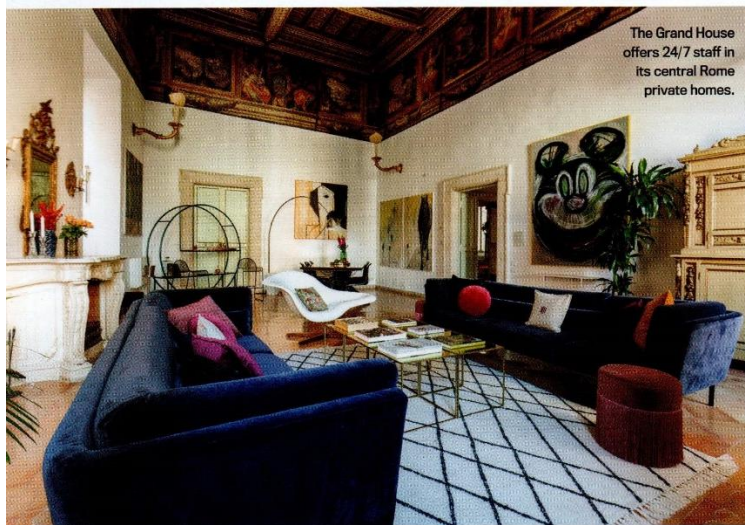
The Grand House offers 24/7 staff in its central Rome private homes.

La Réserve operates 10 fully equipped apartments inside a Haussmann-style building in Paris's 16th Arrondissement. Apartments can be personalized with books and music, stocked with groceries and wine, and rearranged for a reception, for instance. Services include a 24/7 butler and concierge, a dedicated housekeeper and room service. Personal training sessions in the apartment, a boot camp in the Trocadéro gardens and access to the Roland-Garros tennis courts stand in for a gym. lareserveparisapartments.com