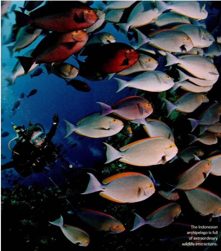
The Indonesian archipelago is full of extraordinary wildlife interactions.

crew-to-guest ratio, sundeck, lounge and bar, and outdoor Jacuzzi.