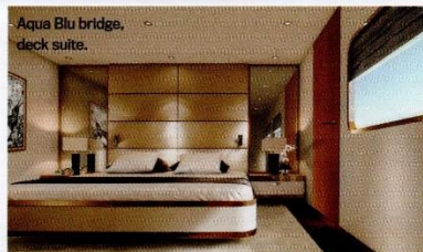
Aqua Blu bridge, deck suite.

The nine itineraries are equally impressive: Komodo National Park, with its 5,000 giant lizards and protected waters; the Raja Ampat archipelago, 27,000 square miles of land and sea in the Coral Triangle; and Ambon and the Spice Islands, where nutmeg plantations lie within view of a volcano. Just pick whichever takes your fancy. Amy DiLuna