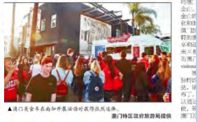
▲澳門美食車在舊金山加開展活動時獲得熱烈反應。

【僑報訊】為了展示澳門文化、美食與旅遊，由澳門政府旅遊局主辦的「澳門美食車」活動，將於5月30日至6月3日，在舊金山為期五天的免費美食車活動。澳門美食車將以全新面貌和文化底蘊，吉祥物「康康」將與多個金山5個澳門美食攤位，讓市民能親身體驗澳門多元文化。此外，活動還將配合「澳門美食車」活動，讓市民能親身體驗澳門多元文化。