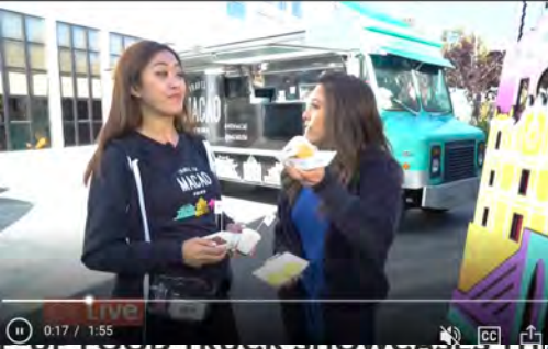
... FOOD TRUCK SHOWCASES THE DELICIOUS CULTURE OF MACAO, CHINA, THROUGHOUT SAN FRANCISCO

... states, California, San Francisco - 05-28-2019 (PRDistribution.com) — Five-Day Celebration with Interactive Food Experiences