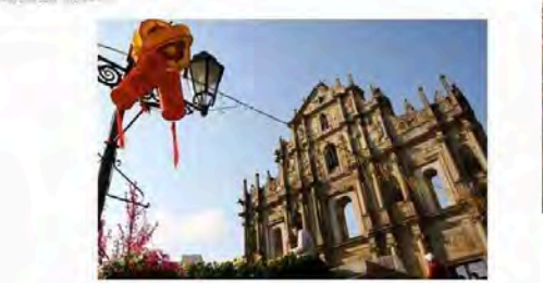
Macao Government Tourism Office USA May 29 · 🌐

... states, California, San Francisco - 05-28-2019 (PRDistribution.com) — Five-Day Celebration with Interactive Food Experiences