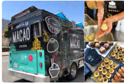
9:31 PM - 29 May 2019 from San Francisco, CA

The @macaousa food truck is hitting the streets of SF this week! Got a sneak peek today of the free treats they'll be serving up to introduce San Franciscans to the gastronomy of Macao. Did I mention they're also giving away a trip, too?! #wowmacao