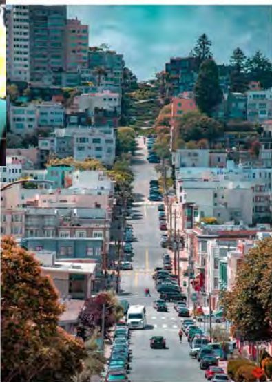
👍 🍌 🍷 78 1 Comment 20 Shares Like Comment Share