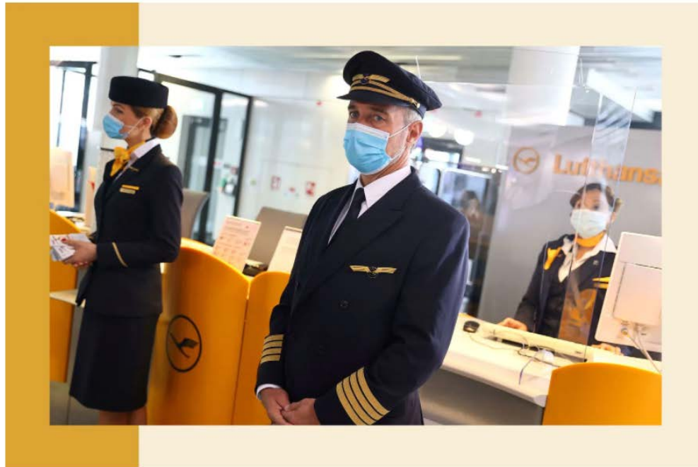
Employees of Lufthansa wear protective masks as they wait for passengers at a boarding gate.

Lufthansa to roll out rapid coronavirus testing, a move that could change pandemic air travel