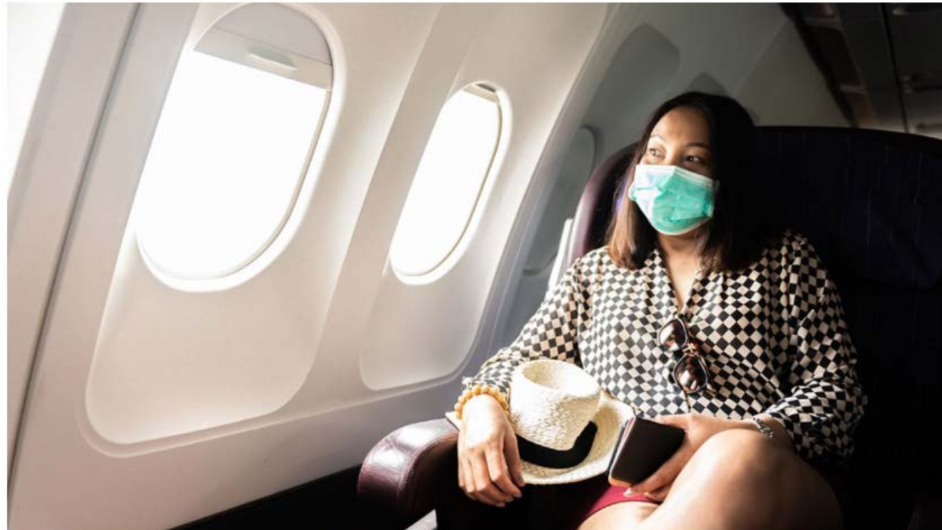
Travel advisors can expect a lot of changes at the airlines after the pandemic.