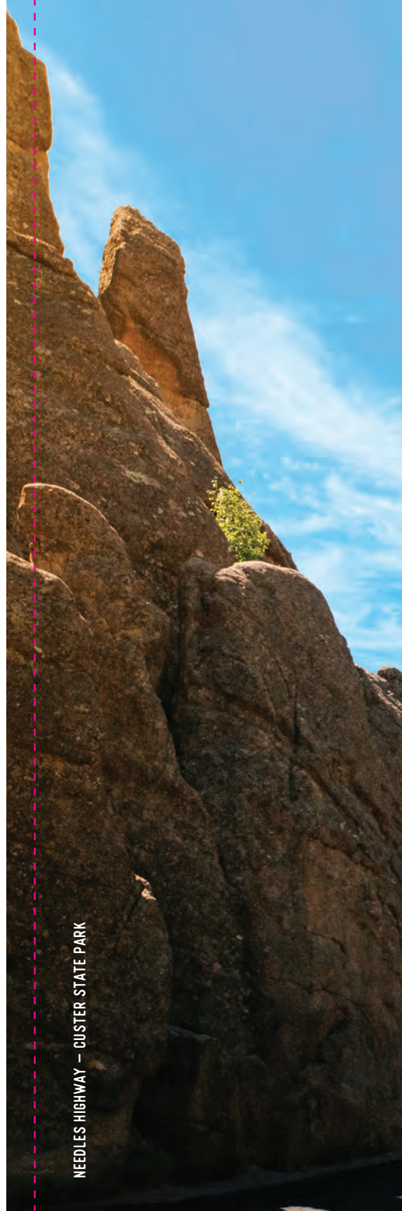
NEEDLES HIGHWAY – CUSTER STATE PARK