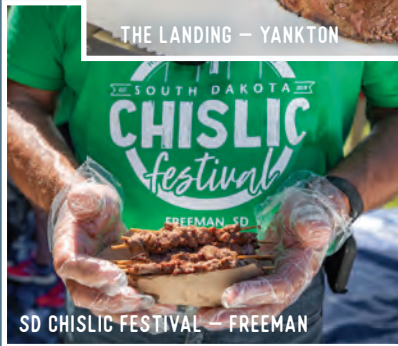
SD CHISLIC FESTIVAL – FREEMAN