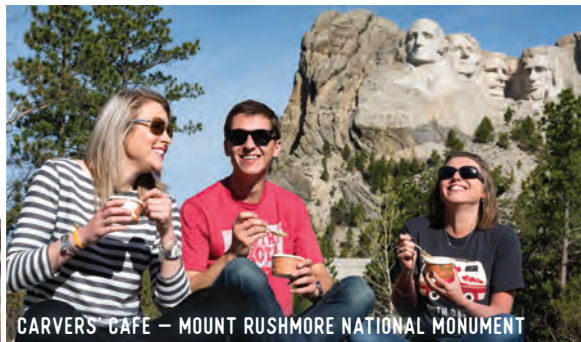
CARVERS CAFE – MOUNT RUSHMORE NATIONAL MONUMENT