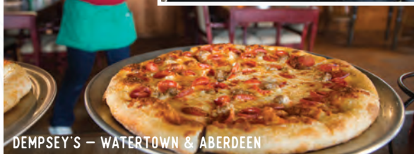
DEMPSEY'S – WATERTOWN & ABERDEEN