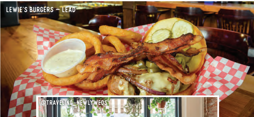
LEWIE'S BURGERS – LEAD