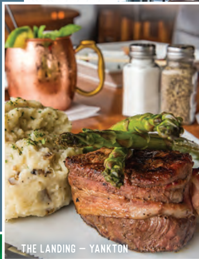
THE LANDING – YANKTON