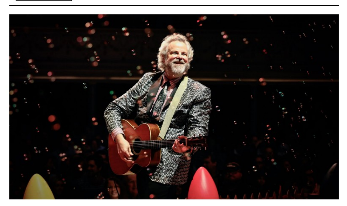
The headliner of Texas Summer Jam at Toyota Music Factory is Robert Earl Keen.

Things are finally getting back to normal as live music events and indoor film festivals return to Dallas. But there's plenty of variety this weekend — attend a seafood restaurant's 11th anniversary, celebrate a popular fitness studio's North Texas expansion, or explore a dinosaur wonderland. These are the best things to do in Dallas this weekend.