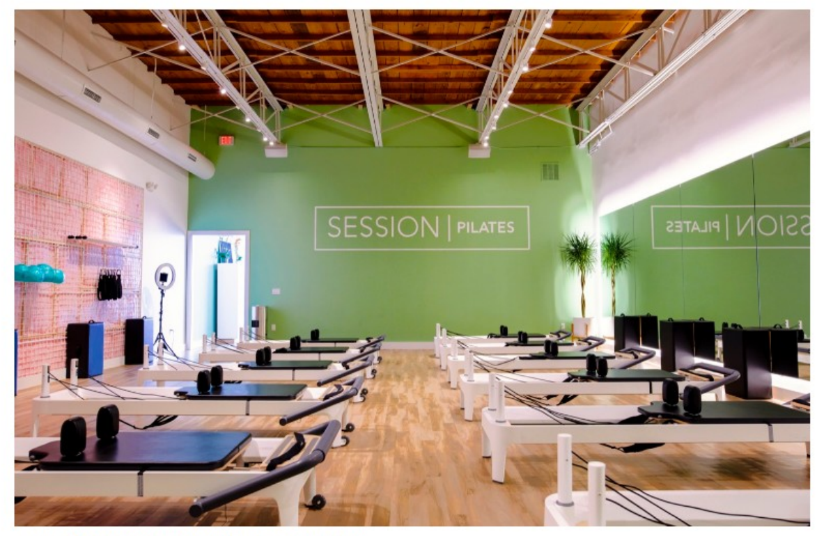
The Lakewood location of Session Pilates.

Fair Park Coliseum will be playing host to a concert by the Turtle Creek Chorale this Sunday at 7:30 pm. "Holidays Interrupted" is the first in-person event by the chorus since December 2019 and will feature free holiday tunes. Snacks will be available for purchase from Fletcher's Corny Dogs like snow cones, funnel cakes, fried Oreos, and more. RSVP is recommended but not required.