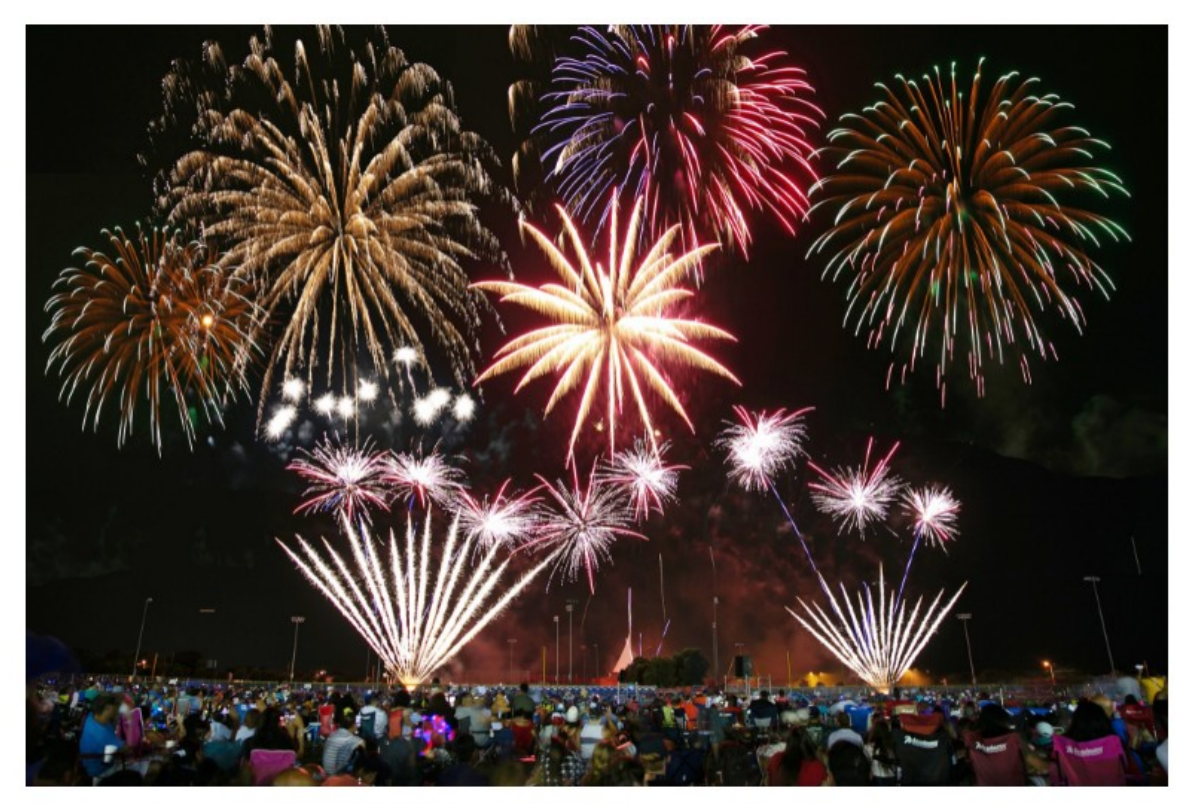
Celebrate Independence Day early at Allen's USA Celebration this Saturday.