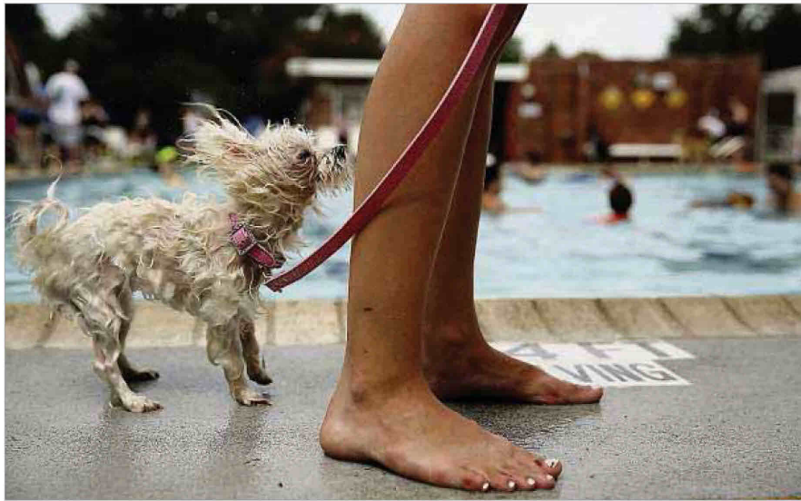
2017 File Photo

It's puppies in the pool at a pair of dog splash events. Paws in the Pool-ooza is Aug. 14 in Cedar Hill; Pooch Plunge is Aug. 15 in Rowlett.