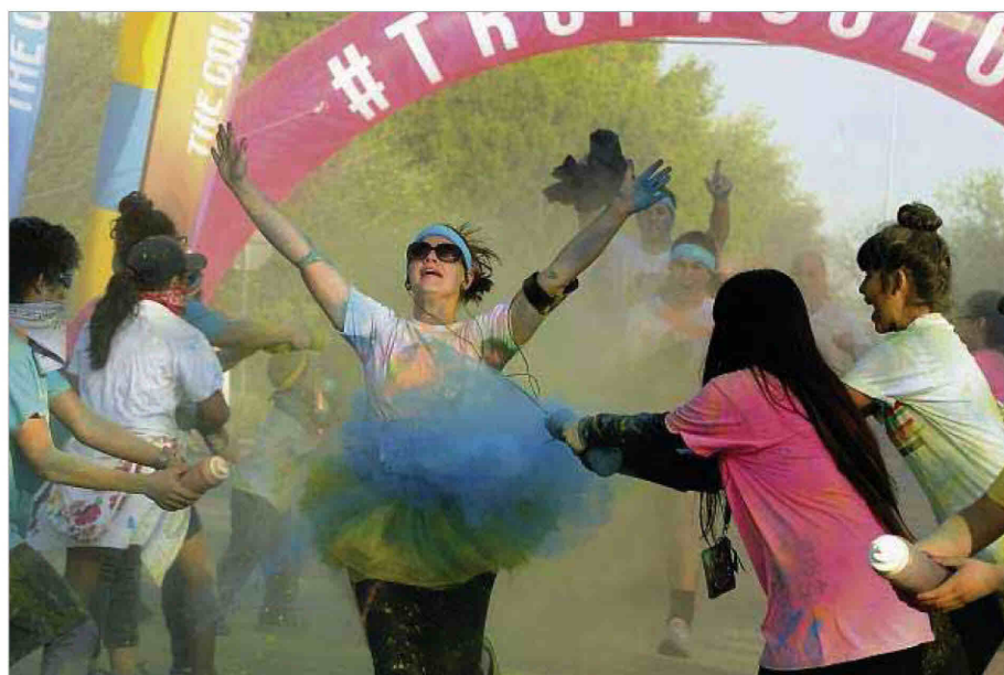
2016 File Photo

For this fun run, touted as the "Happiest 5K on the Planet," runners are encouraged to wear white shirts when they start. At each kilometer, they will be bombarded