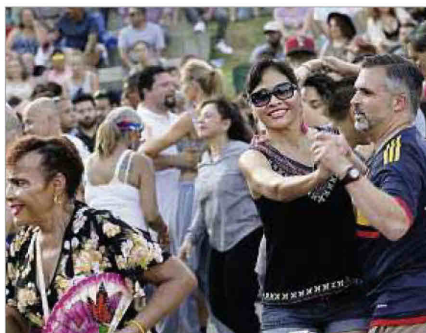
2019 File Photo