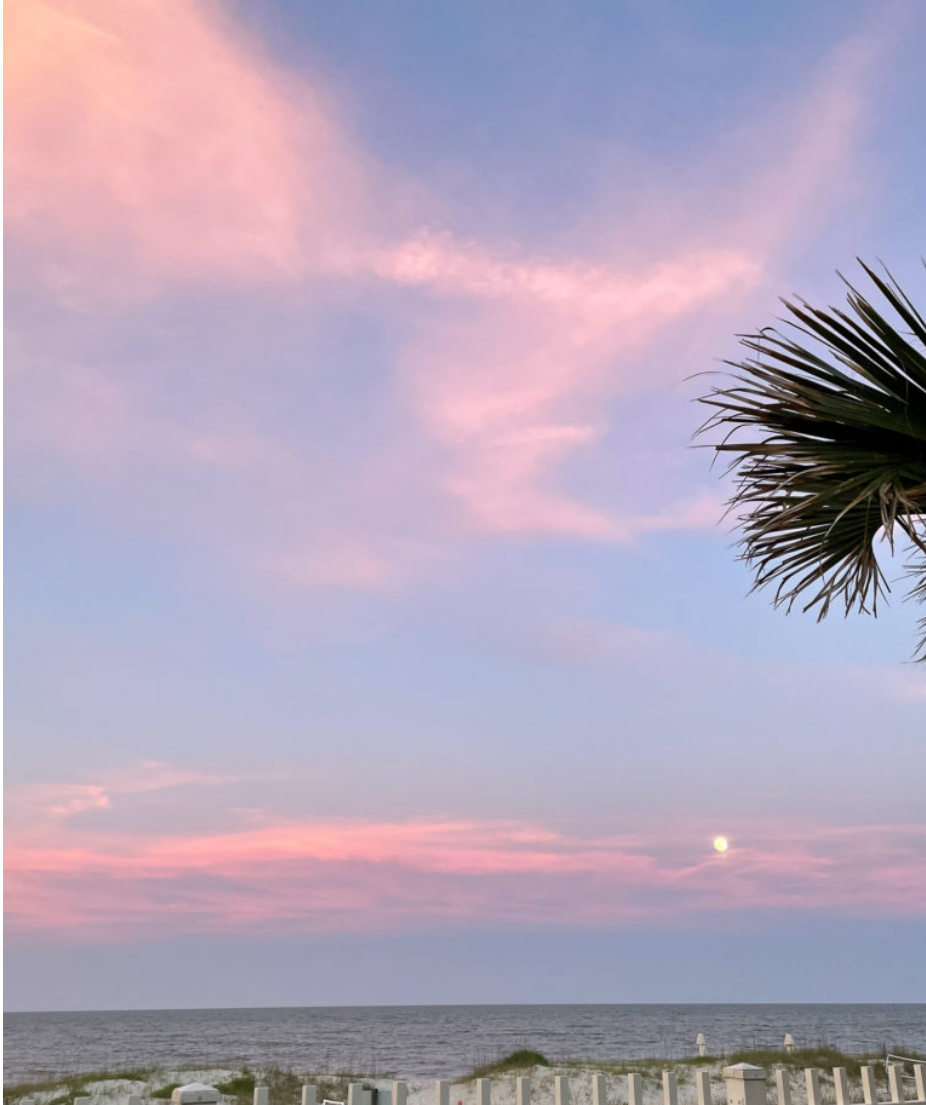
The SUNSETS on Amelia Island were some of the most beautiful I've seen!