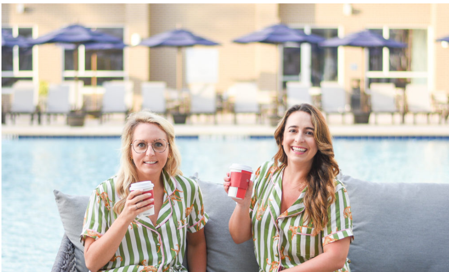
We loved breakfast at the Springhill Suites each morning! More on our PJ's below!

~ First, I just wanted to say a big heartfelt THANK YOU to everyone who shared in the joy and excitement of our engagement this weekend! Every single kind word has meant more than you know and I can feel the love being multiplied by all of you! In case you missed it...we are ENGAGED! Of course, I can't wait to share more about it! But...our engagement story needs and deserves it's own post...stay tuned for our full engagement story in a few days 😊