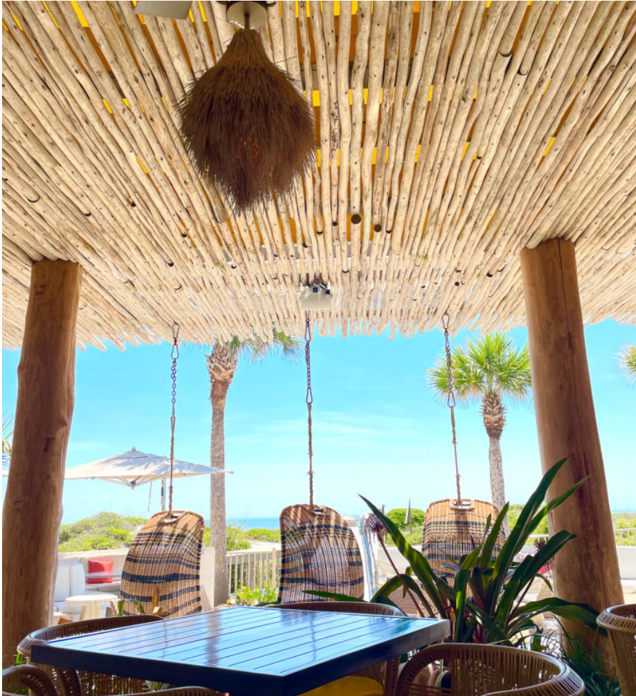
How pretty is Coquina, the outdoor restaurant at the Ritz!