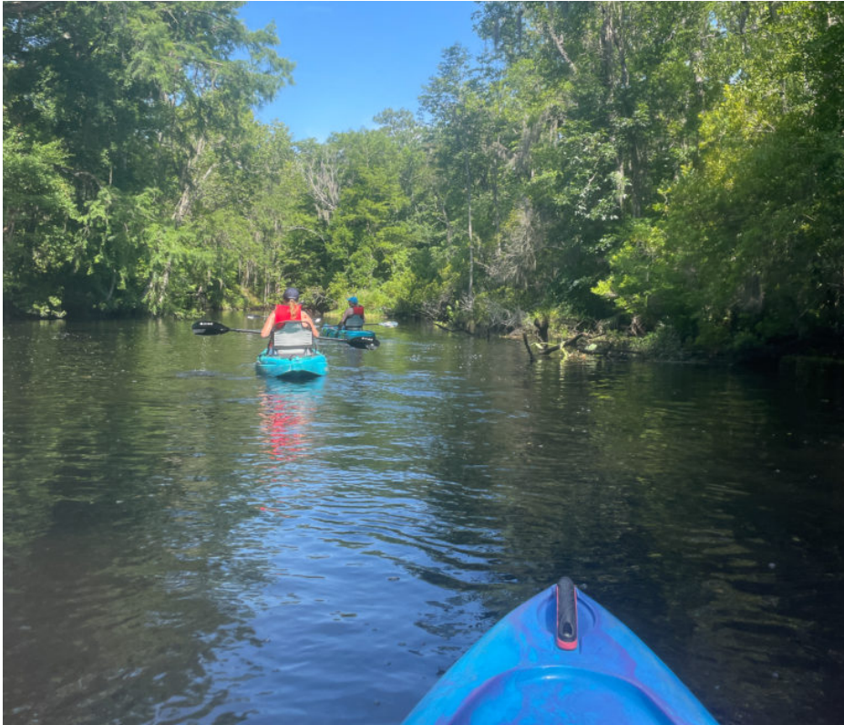
We loved our morning of Kayaking with Amelia Island Adventures!