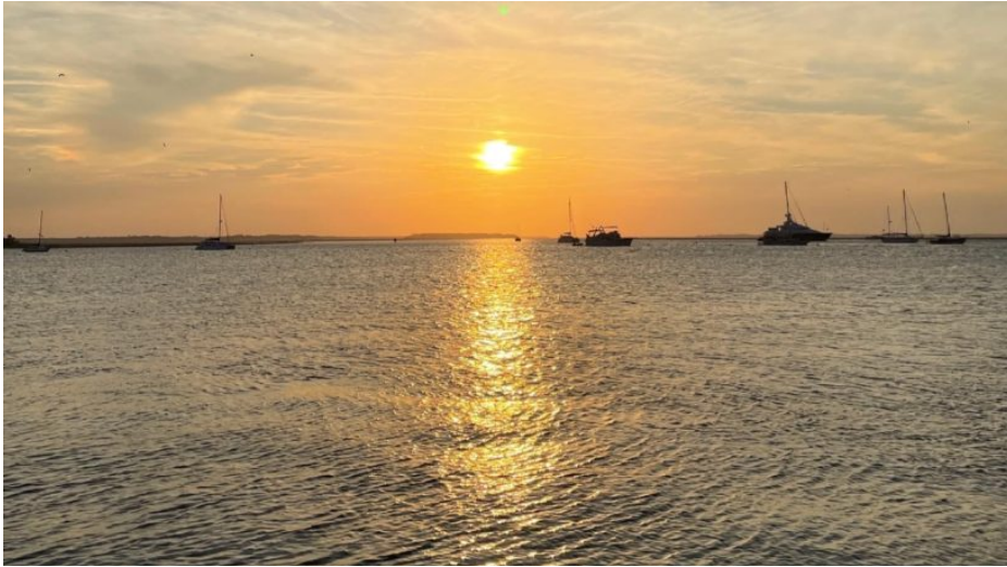
The sunset from the docks at the Fernandina Marina!