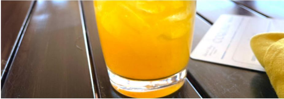
This Habañero Mango Margarita from Coquina is one of the BEST I've had!