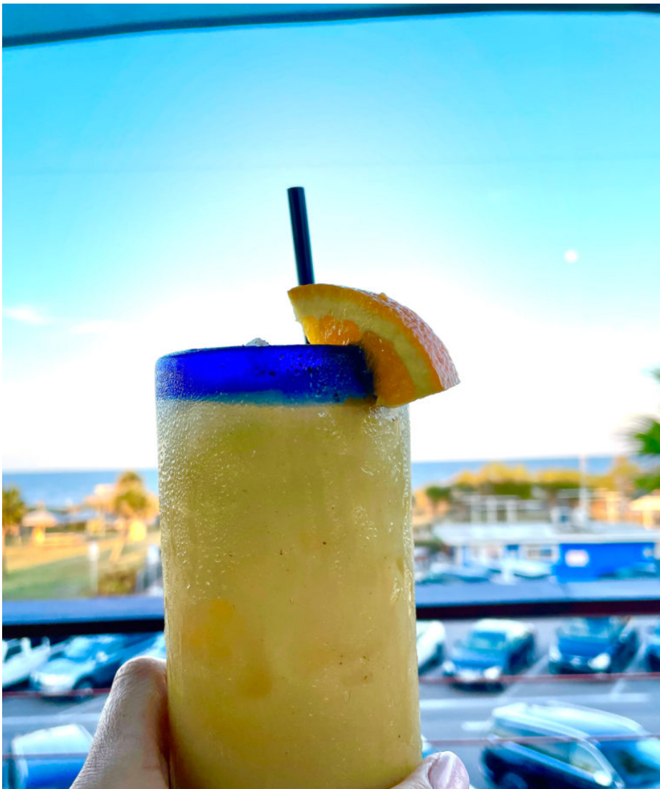
My Painkiller Rum Drink at the Salt Life Food Shack!

We LOVED the pool at the Springhill Suites! More on my outfits below!