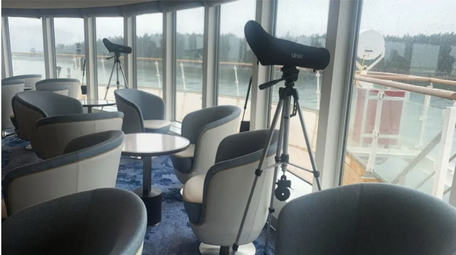
Spotting scopes and binoculars are situated around the Ocean Victory.

Indeed, while this a new market for American Queen Voyages -- best known for its paddlewheel ships that ply U.S. rivers -- the expedition team on the new ship is anything but green.