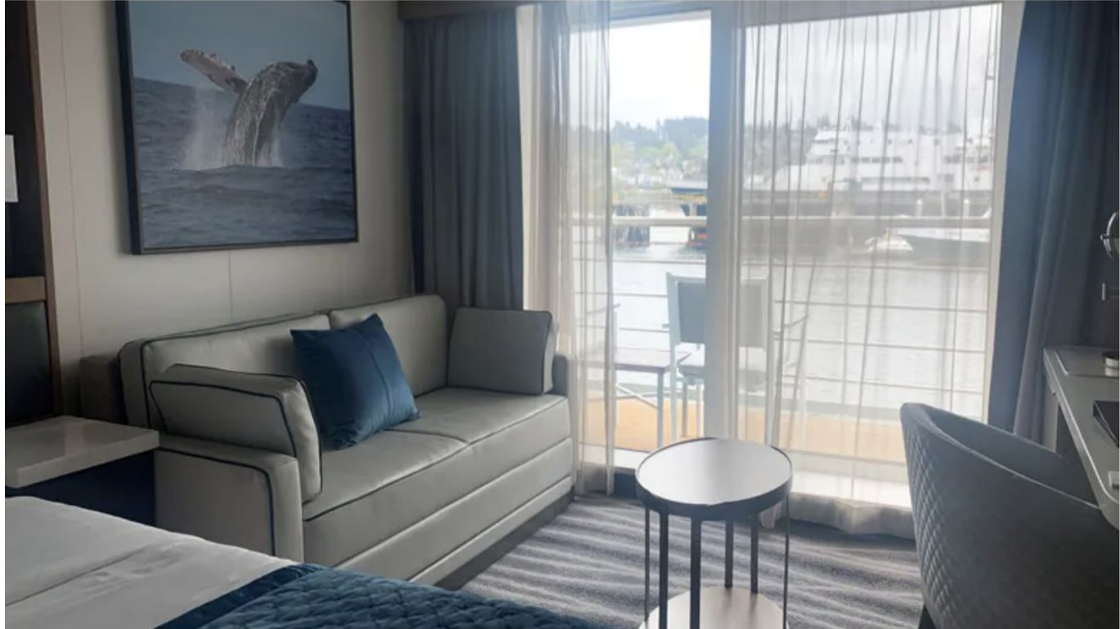
A stateroom on the Ocean Victory.

But the real game-changer is the adventure offerings, science programs and staff.