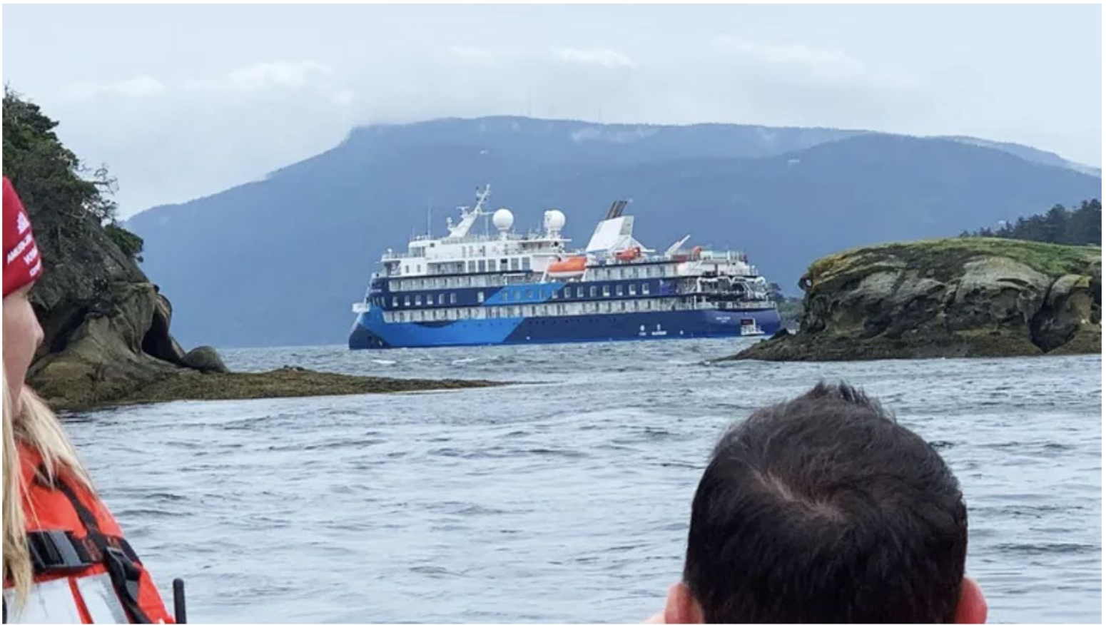
The Ocean Victory in the San Juan Islands in Washington State.